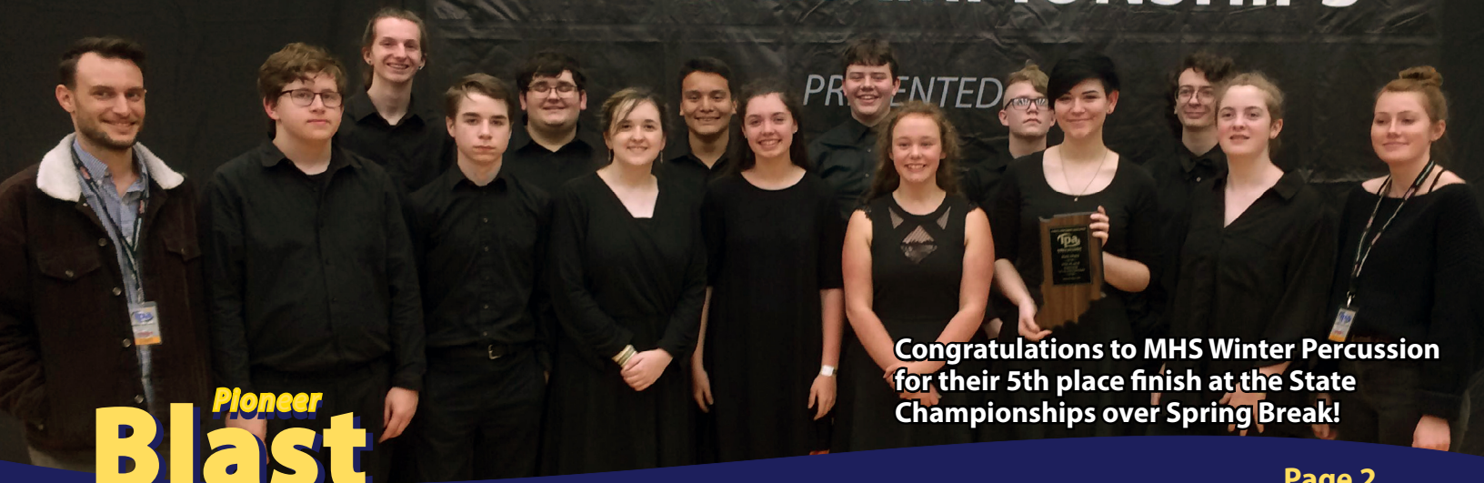
Congratulations to MHS Winter Percussion for their 5th place finish at the State Championships over Spring Break!