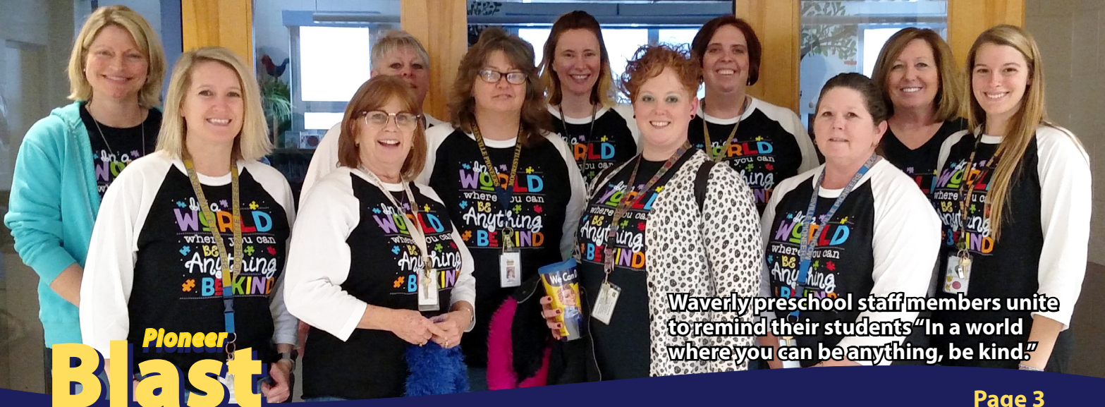
Waverly preschool staff members unite to remind their students "In a world where you can be anything, be kind."