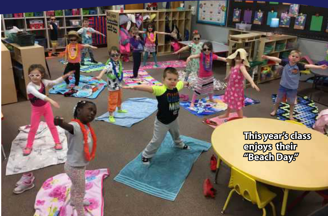
This year's class enjoys their "Beach Day!"